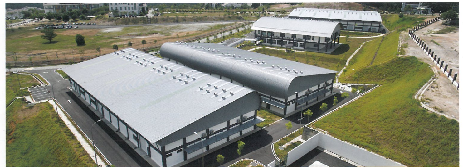
IPG Kampus Pendidikan Teknik - Labu, Negeri Sembilan - Roofing.