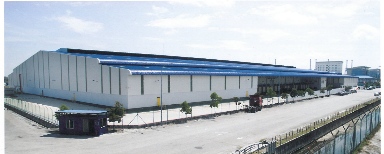
D'Buaya Warehouse - Port Klang Free Zone - Cladding.